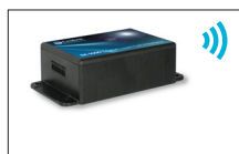
DI-1000ZP Wireless Load Cell Interface