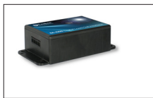
DI-100/DI-1000U Digital Load Cell Interface