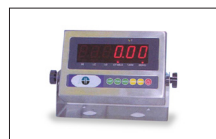
RD-1000 Resistive Load Cell Display