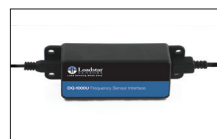
AI-1000 Signal Conditioner