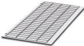
The figure shows the version GPE 20x8 WH

Engraving material, Sheet, white, Unlabeled, Can be labeled with: Gravur, Plotter, Mounting type: Adhesive, Lettering field: 13 x 9 mm