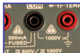
IEC Rated Inputs