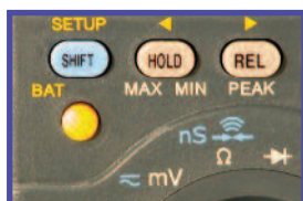
Easy to Understand Interface