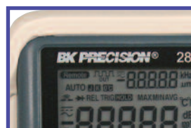
Back Lit LCD (2890A only)