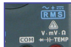
Square Wave Output (2890A only)