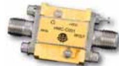
Hermetic Connectorized Module