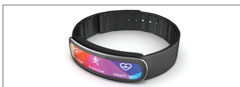
Wearables (Smart Watches, Health Monitors, AR & VR)