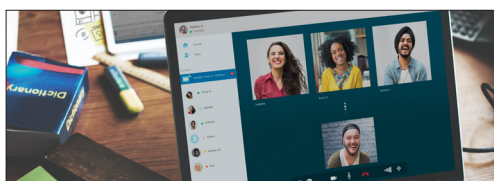
5G Networking/Telecommunications Communication Modules (WiFi Routers and Mesh Devices)