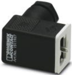
Valve connector, 4-pos., type C, unconnected, screw connection, cable screw connection Pg7

Please be informed that the data shown in this PDF Document is generated from our Online Catalog. Please find the complete data in the user's documentation. Our General Terms of Use for Downloads are valid ( http://download.phoenixcontact.com )