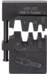
Die, for Crimpfox-M, for ferrules 0.25 - 10 mm 2 , packed in a serial storage box

Please be informed that the data shown in this PDF Document is generated from our Online Catalog. Please find the complete data in the user's documentation. Our General Terms of Use for Downloads are valid ( http://download.phoenixcontact.com )