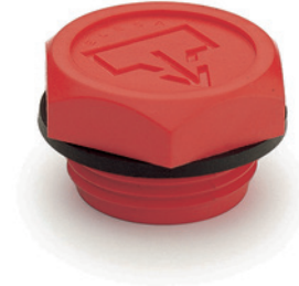
ELESA Original design

TSD. oil drain plugs are suitable for mounting aluminium plates with graphic symbols type MH. (see page 1302).