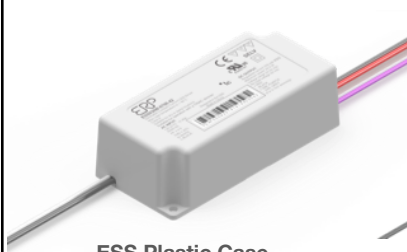
ESS Plastic Case L 84 x W 40 x H 25 mm (L 3.30 x W 1.57 x H 0.99 in)