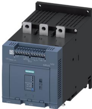
SIRIUS soft starter 200-600 V 370 A, 24 V AC/DC Screw terminals Thermistor input