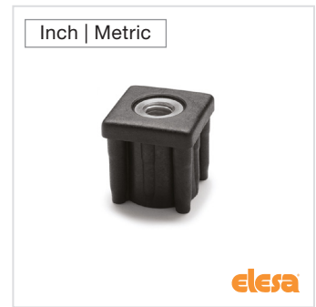
ELESA original design NDX.Q