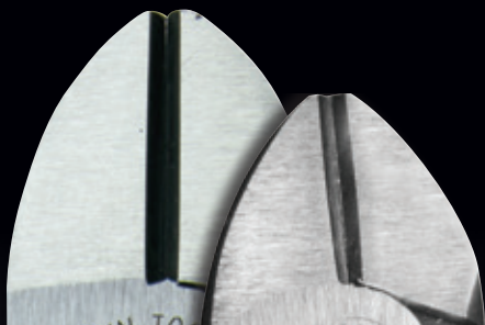
*J2000-59 vs. "standard" Klein

Extra-long cutting blades provide greater cutting ability.