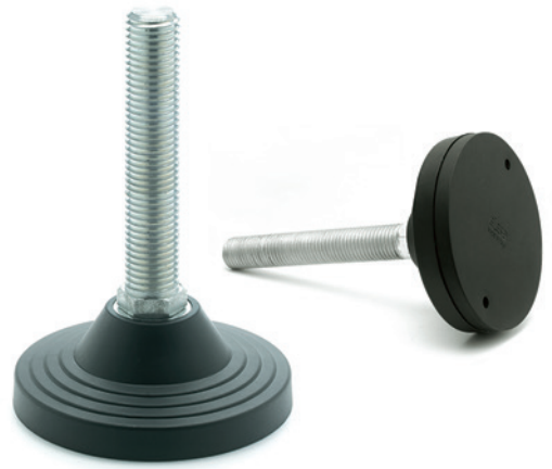
ELESA Original design