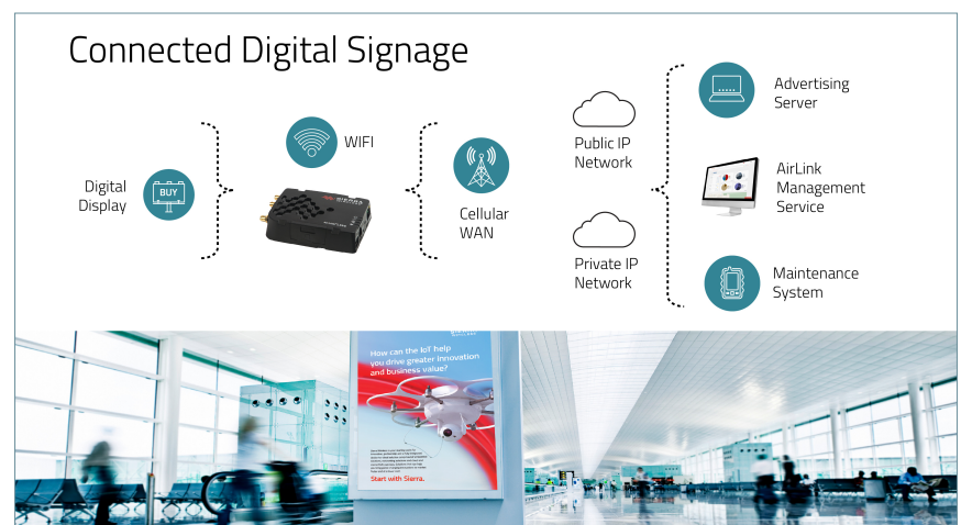
Application Example - Digital Signage