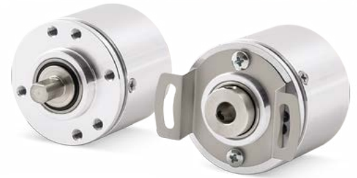
IQ36 • CKQ36