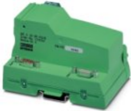
The illustration shows the version IBS IL 24 BK-DSUB

INTERBUS bus coupler, subminiature connection, transmission speed 2 Mbaud, 24 V DC, without accessories