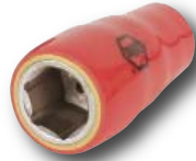
Inch - 6 Point