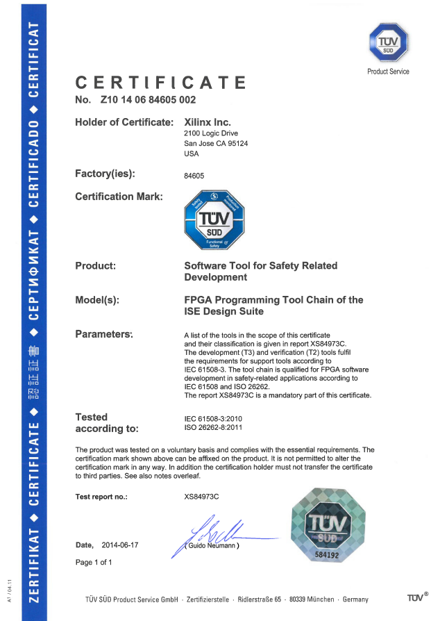
Figure 2: Certification