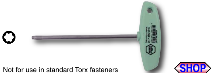
Not for use in standard Torx fasteners

364 TORXPlus® Screwdriver, With Wiha-T-handle Blade high alloy chrome-vanadium-molybdenum steel, hardened, hard chromed. Wiha-T-handle high quality plastic, impact resistant.