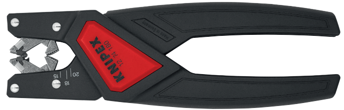
12 74 180 SB