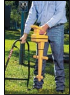
3M™ Dynatel™ Cable/Pipe and Fault Locator 2273M

The receiver also accommodates four user-definable auxiliary frequencies and allows the user to perform a self-calibration operation at any frequency at any time. With the easy-to-use configuration tool, users can enable or disable any of 22 frequencies.