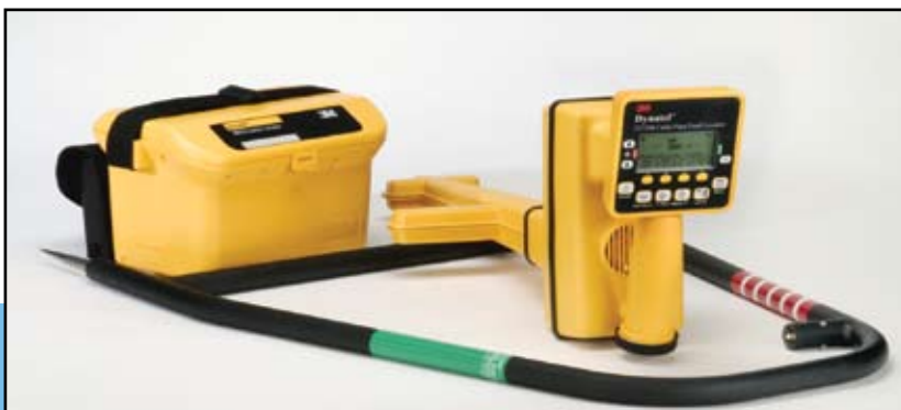
3M™ Dynatel™ Cable/Pipe and Fault Locator 2273M