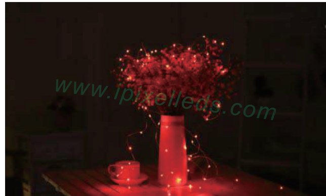
photo frame/decorative plant