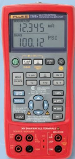
Fluke 725Ex Multifunction Process Calibrator

Fluke offers the widest range of reliable, accurate and intrinsically safe test tools. Including true-rms multimeters, infrared thermometers, process calibrators, pressure calibrators, loop calibrators and precision pressure test gauges.