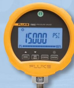
700G Series Precision Pressure Test Gauges