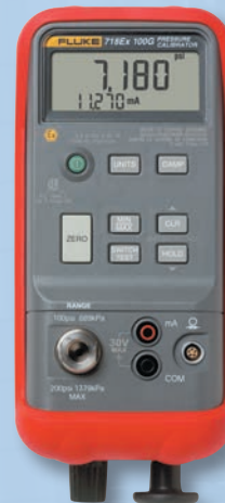
Fluke 718Ex Pressure Calibrator