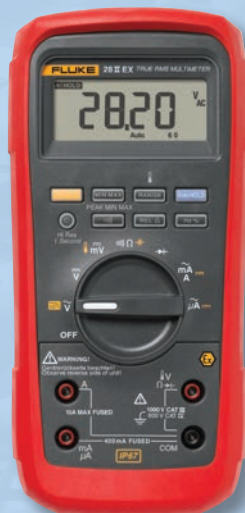
Fluke 28II Ex True-rms Industrial Multimeter