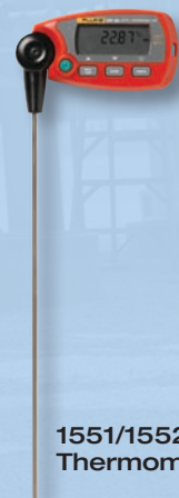
1551/1552 "Stik" Thermometers