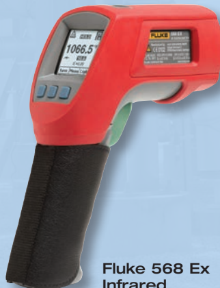
Fluke 568 Ex Infrared Thermometer