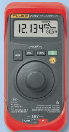
Fluke 707Ex Loop Calibrator