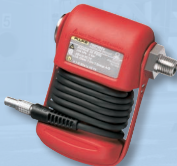
Fluke 700PEX Pressure Modules