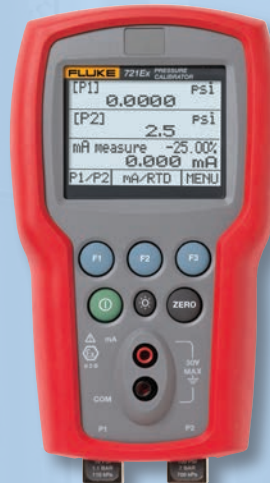
Fluke 721Ex Precision Pressure Calibrator