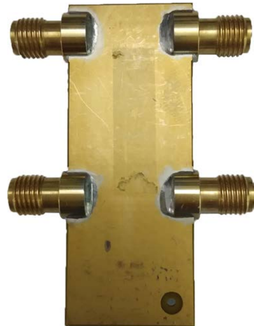
Figure 2. EV1HMC8412LP2F Secondary Side

For full details on the HMC8412 , see the HMC8412 data sheet, which must be consulted in conjunction with this user guide when using the EV1HMC8412LP2F.