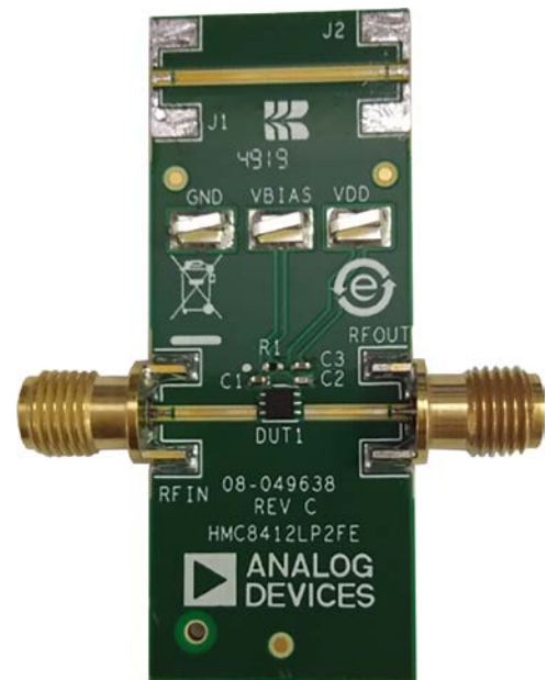
Figure 1. EV1HMC8412LP2F Primary Side