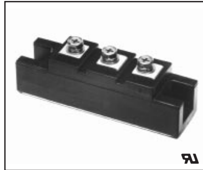
CD411260, CD411660 Dual Diode POW-R-BLOK™ Modules 60 Amperes/1200-1600 Volts