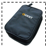
Soft Bag (optional)