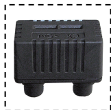
Capacitance Ext Module