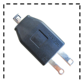
5V, 1KHz Output