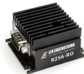
Single Axis Controller + Driver R256-RO