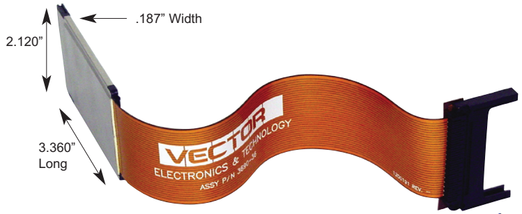
P/N 3690-36 12.0"L