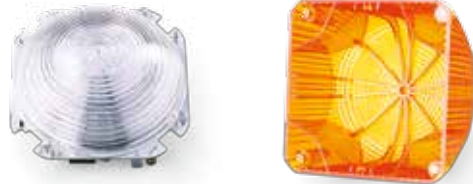
Internal diffuser and special lens pattern for optimal 360° signalling effect