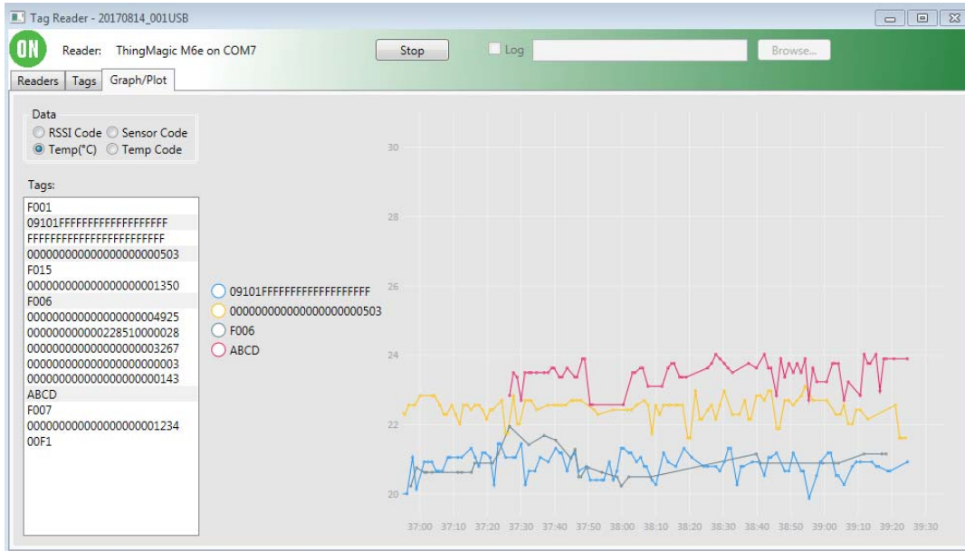
Figure 5. Sensor Information Displayed Under "Graph/Plot" Tab

The second way to view data is by setting up a Log File using the "Browse" button at the top of application and checking the "Log" checkbox. This will dump all the information collected during the session to a logfile including EPC, sensor code, timestamp, etc.