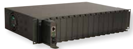
Media Converter 19" 2U Rack Chassis, 6 Slots Model# EIS-RACK-16

Desk or wall mount as stand-alone products or install into available 19-inch rack chassis system. The chassis system supports hot-swap installation of media converters, Ethernet extenders, and redundant power supplies to power up to 16 media converters and extenders.