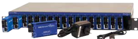
18-slot chassis, -20°C to +70°C, AC power Model# IE-POWERTRAY/18-AC

The IE-PowerTray/18-AC can be rack-mounted into standard 19" equipment racks and features extended temperature operation and an internal AC power supply (included).