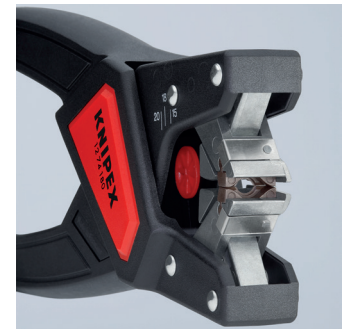
Complex cutter design for precise and damage-free stripping of round cables