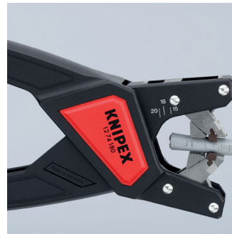
Required stripping length easy to read