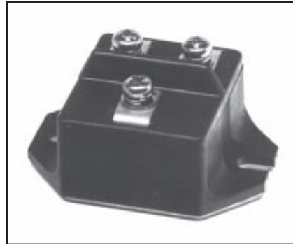
CN24__500N, CC24__500N Super Fast Recovery Dual Diode Modules 50 Amperes/300-600 Volts