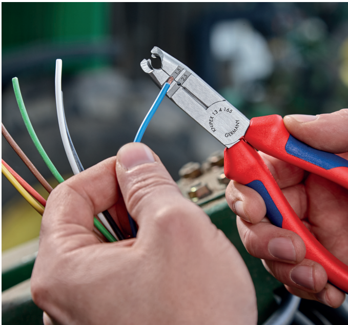
Wire stripping holes for 1.5 and 2.5 mm 2 conductors