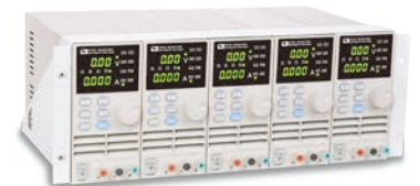
IT-E152 19" Rack Mount Diagram