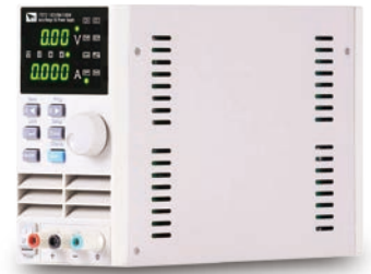
IT6720 60V/5A/100W IT6721 60V/8A/180W