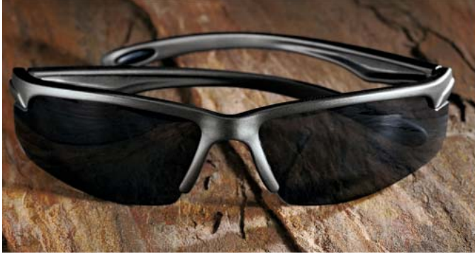
SS1302AF-G, Gray Frame Gray AF 10ea/cs