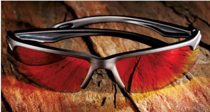
SS1329AS-G, Gray Fr Red Mir AS 10ea/cs