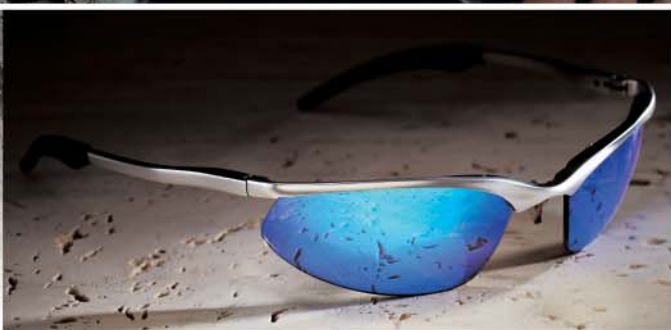
Silver Aluminum Frame, Blue Mirror Anti-scratch Lens (SS1428AS-S)

The 1400-Series, simply put, is like a long ride along a coastal highway: smooth, clear, open. Featuring a half-rim design with wraparound aluminum frame, adjustable nosebridge, spring-hinged temples, and blue-mirrored lenses, these glasses come complete with a microfiber storage bag.