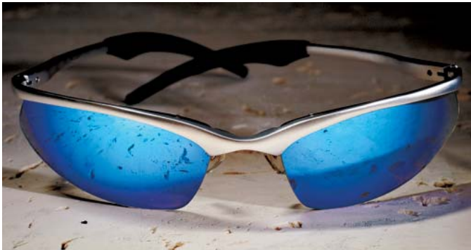
SS1428AS-S, SlvAlumFra BlueMirAS 10ea/cs