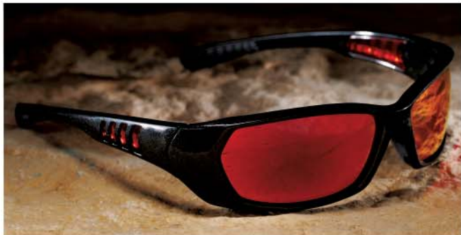
Black Frame with Color-accented Temples, Red Mirror Anti-scratch Lens (SS1629AS-B)

The 1400-Series, simply put, is like a long ride along a coastal highway: smooth, clear, open. Featuring a half-rim design with wraparound aluminum frame, adjustable nosebridge, spring-hinged temples, and blue-mirrored lenses, these glasses come complete with a microfiber storage bag.