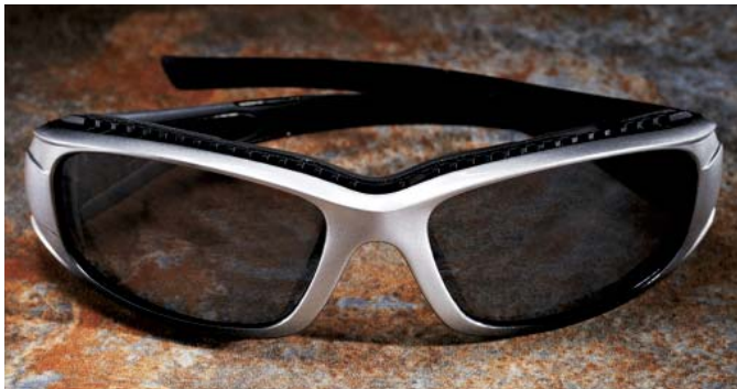
SS1514AS-S, SlvBkFrame SlvMirAS 10ea/cs