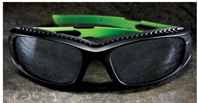
SS1514AS-B, Bk/Gr Frame SlvMirAS 10ea/cs