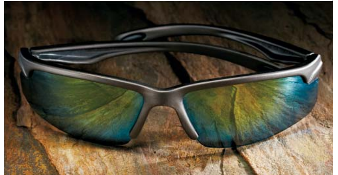
SS1330AS-G, Gray Fr Yel Mir AS 10ea/cs