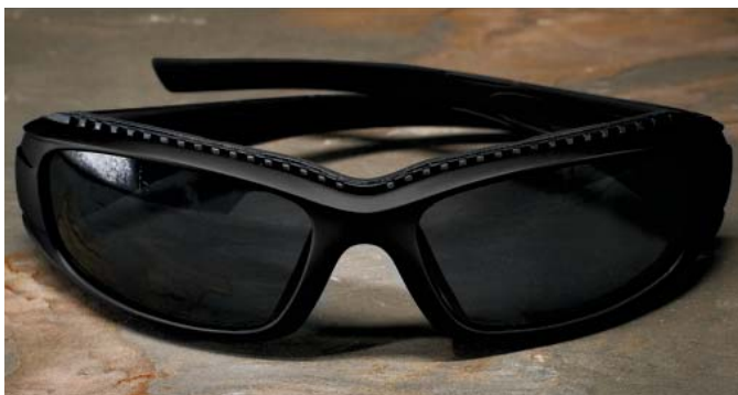
SS1511AF-B, BkFr GrPolarize AF 10ea/cs