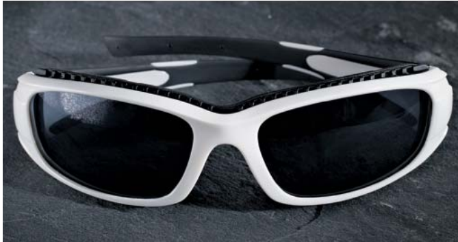
SS1502AF-W, White Frame GrayAF 10ea/cs