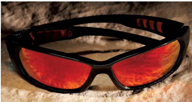
SS1629AS-B, Bk Frame Red Mir AS 10ea/cs