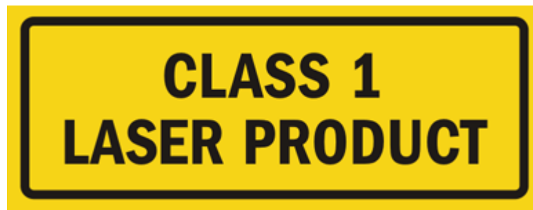
Figure 1. Class 1 laser product label

The VL53L0X contains a laser emitter and the corresponding drive circuitry. The laser output is designed to remain within Class 1 laser safety limits under all reasonably foreseeable conditions including single faults in compliance with IEC 60825-1:2014 (third edition). The laser output will remain within Class 1 limits as long as the STMicroelectronics recommended device settings are used and the operating conditions specified in the STM32L4+ datasheets are respected. The laser output power must not be increased by any means and no optics should be used with the intention of focusing the laser beam. Figure 1 shows the warning label for Class 1 laser products.