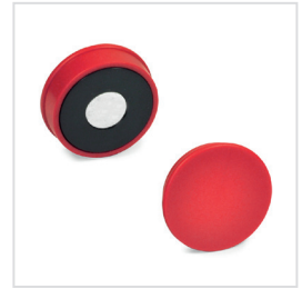
View of magnetic surface