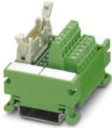
VARIOFACE COMPACT LINE, interface module for 8 channels, for assembly on DIN rail NS 35/7.5, screw connection

Please be informed that the data shown in this PDF Document is generated from our Online Catalog. Please find the complete data in the user's documentation. Our General Terms of Use for Downloads are valid ( http://download.phoenixcontact.com )