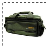
Soft Bag (optional)