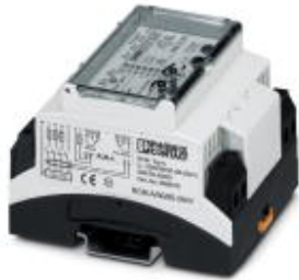
Differential current monitor in type A version for detecting pulsing AC and DC leakage currents at 50/60 Hz.

Please be informed that the data shown in this PDF Document is generated from our Online Catalog. Please find the complete data in the user's documentation. Our General Terms of Use for Downloads are valid ( http://phoenixcontact.com/download )