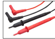
Premium silicone test leads included with both meters

* When registered within 60 days of purchase.