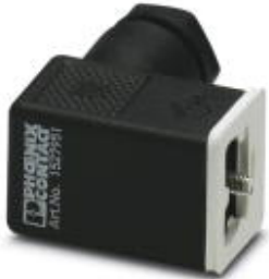
Valve connector, 3-pos., type C, unconnected, screw connection, cable screw connection Pg7

Please be informed that the data shown in this PDF Document is generated from our Online Catalog. Please find the complete data in the user's documentation. Our General Terms of Use for Downloads are valid ( http://download.phoenixcontact.com )