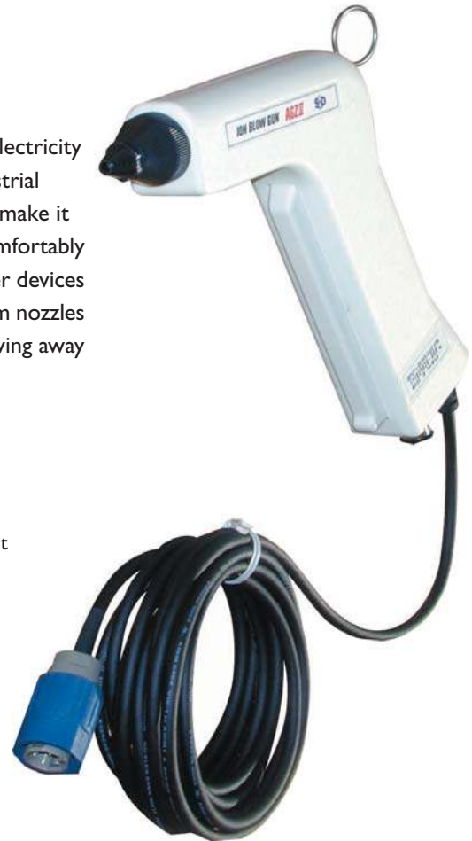
Static Decay & Ion Balance Characteristics of the AGZIII Model

* Note Nozzle Tip and AC Adapter come standard with Gun