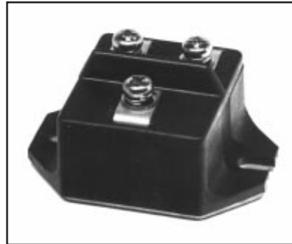
CN24_ _500N, CC24_ _500N Super Fast Recovery Dual Diode Modules 50 Amperes/300-600 Volts