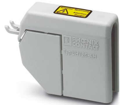
Illustration shows the product version UHV 25-AH

http://eshop.phoenixcontact.de/phoenix/treeViewClick.do?UID=2130444