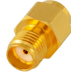
Generic photo used for illustration purposes only