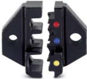
Spare die for CRIMPFOX-RCI 6-1

Please be informed that the data shown in this PDF Document is generated from our Online Catalog. Please find the complete data in the user's documentation. Our General Terms of Use for Downloads are valid ( http://download.phoenixcontact.com )