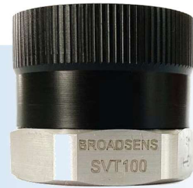
Wireless vibration & temperature sensor SVT100-A

SVT100-A is an ultra-low power wireless vibration and temperature sensor designed for machine condition monitoring. It has the advantages of easy installation, easy usage and high battery efficiency. SVT100-A consists of low power wireless IC, high performance 3-axis accelerometer and high precision temperature sensor. It can monitor the machine status in real time or by schedules. Multiple SVT100-As can be grouped together and divided into different groups at the gateway GU200 (sold separately). They can be synchronized to provide advanced monitoring and analysis ability.