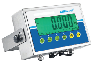
AE 403 Indicator